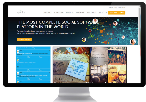
websites or digital spaces