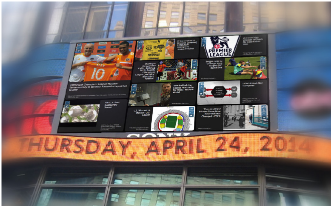
jumbotrons or TVs