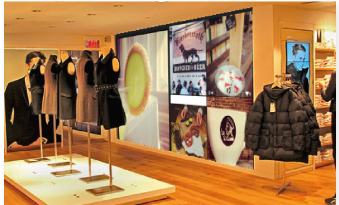
in-store, lobby or company HQ