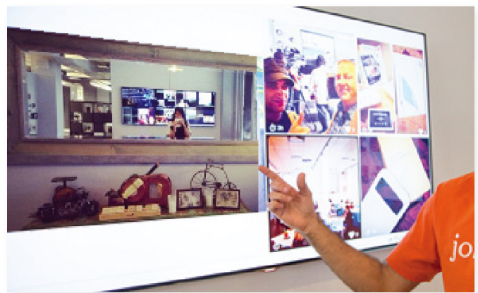
events or conferences

Plug into 15+ social channels, and filter the best content to power gorgeous visualizations. Listen to the expected channels – Twitter, Facebook, Instagram, Google+ and RSS feeds – and the untapped ones like YouTube, LinkedIn, Bazaarvoice, Tumblr, Weibo and more.